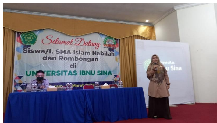
Figure 3 Submission of Material by Resource Person

This planning activity is carried out carefully so that the achievable targets can be realized quickly and accurately (Rabiudin et al., 2022). Furthermore, participants actively participated in this activity, as evidenced by the enthusiasm of the participants by following this event to completion.