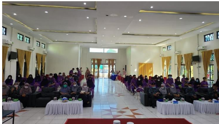
Figure 2 Class XII students of SMA Islam Nabilah Batam

The results achieved in community service activities with 62 participants who attended and followed the course of the event were education and understanding for class XII students about future career planning.