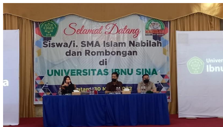
Figure 4 Submission of Material Regarding the Importance of Education and Work

However, nowadays, there are many kinds of jobs in the informal sector. The informal sector does not require special education in the process, or some informal sectors are now officially included in the curriculum of a study program at a university. The choice of professions that emerged included; designer, music composer, racer, chef/cook, writer, illustrator, fashion stylist, digital marketing, video maker, and so on.