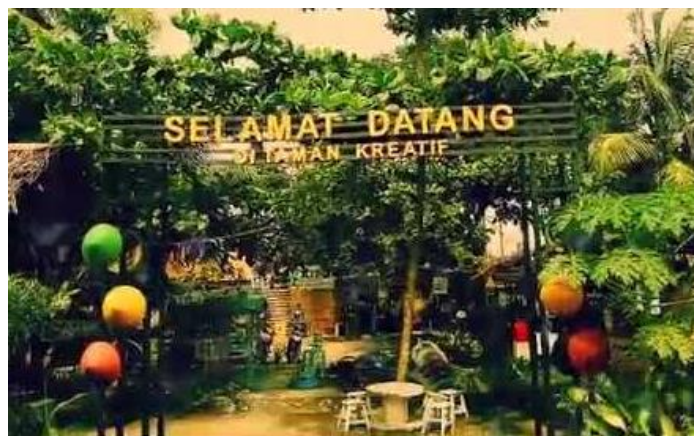
Figure 2 Creative Park Center in Serang City

The method used as an approach to community service is service and assistance to meet needs through business enthusiasm and marketing training with micro, small and medium enterprises (MSMEs) with zoom meetings.