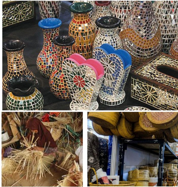
Figure 3 MSME Results Based on Creative Economy