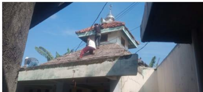
Gambar 9. Kondisi awal musholla