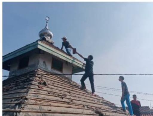
Gambar 8. Pembongkaran Musholla