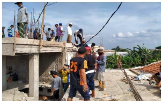
Gambar12. Kondisi musholla progress 20 %