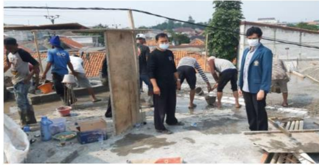
Gambar13. Kondisi musholla progress 35 %

Development of development progress displayed in progress (figure 11, figure 12, figure 13, and figure 14) as a guide to achievement and information that all citizens can know, so that community participation is expected to be more optimal and know the achievement of progress and cost needs that are still needed for the completion of development. The assistance carried out by the implementation of work is expected to encourage the committee and citizens to complete the construction of Musholla Nurul Islam located at Kp Situpete Rt 01/ 06 Kel. Sukadamai Kec. Tanah Sareal Bogor City