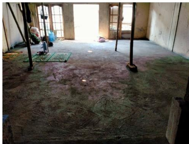
Gambar14. Kondisi musholla progress 40 %

Development of development progress displayed in progress (figure 11, figure 12, figure 13, and figure 14) as a guide to achievement and information that all citizens can know, so that community participation is expected to be more optimal and know the achievement of progress and cost needs that are still needed for the completion of development. The assistance carried out by the implementation of work is expected to encourage the committee and citizens to complete the construction of Musholla Nurul Islam located at Kp Situpete Rt 01/ 06 Kel. Sukadamai Kec. Tanah Sareal Bogor City