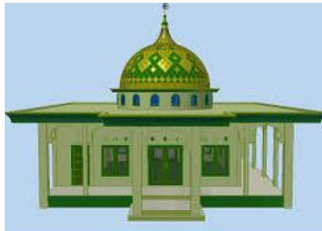
Gambar 2. Prespektif Musolla

has a public bathroom. It is expected that the optimal infrastructure will support the process of religious activities and learning then to meet the needs of pilgrims in the renovation of musholla.