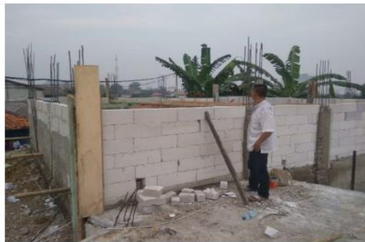
Gambar11. Kondisi musholla progress 10 %

Assistance can be carried out from the beginning of the idea of renovation of musholla delivered by some residents, deliberations, bombing, installation of bouplank to foundation excavation, installation of foundations, sloof land boundaries, aloof mihrab and looping of the central pillar columns (figure 8, figure 9 and figure 10) so that labor and committee are helped in terms of supervision of the quality of work.