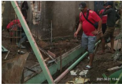
Gambar 10. Kondisi awal Pembangunan progress 5 %

Assistance can be carried out from the beginning of the idea of renovation of musholla delivered by some residents, deliberations, bombing, installation of bouplank to foundation excavation, installation of foundations, sloof land boundaries, aloof mihrab and looping of the central pillar columns (figure 8, figure 9 and figure 10) so that labor and committee are helped in terms of supervision of the quality of work.