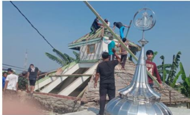
Figure 4. Demolition of old building towers

The initial stage of devotion to the community is in the form of demolition of existing musholla. At this stage, the community team will begin the development work by dismantling and making a bow plank.