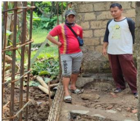
Figure 5. measurement of site, foundation, aloof and columns

The second stage is to take site measurements, foundation excavations, foundation installation, aloof, and columns so that the design can match the conditions in the field.