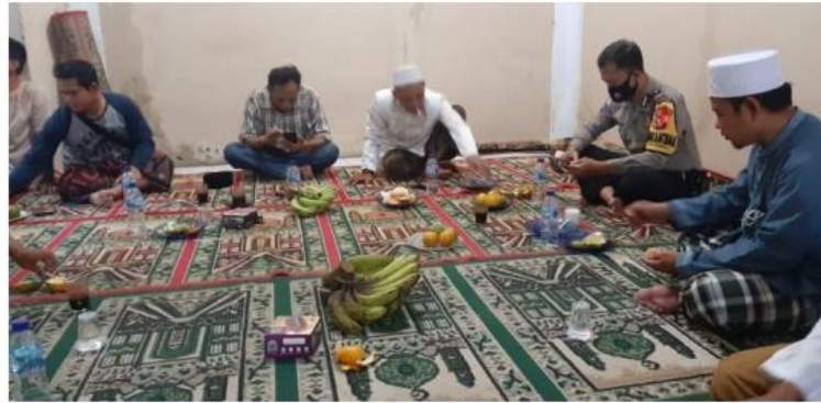
Figure 7. Explanation of design and coordination of development

At each stage of development, activities are always carried out assistance (in figure 6 and figure 7) with the aim that each stage runs according to planning and is carried out jointly, transparently, and can be accounted for Socialization, measurement, and presentation activities were held at Musolla Nurul Islam, located in Kp. Situpete RT. 01/06 Kel. Sukadamai Kec. Tanah Sareal Bogor City. This community service activity starts on May 26, 2021, until now.