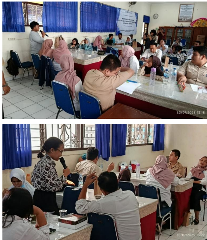
Figure 4. Participant presentation process

In the final stage of the training, each group presented the results of their screenplay writing to the other participants. This presentation session aimed to develop participants' communication skills for conveying story ideas and to provide a reflective space for evaluating their creative processes. Following each presentation, other groups were invited to offer feedback, suggestions, and appreciation for the work presented, thereby fostering an interactive, participatory, and respectful learning environment.