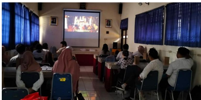
Figure 1. Film Screening

The training began with the screening of two short films: "Hanenda," produced by Rumah Pemberdayaan Hanenda, and "Jungkat Jungkit," created by students of the Film and Television Study Program the screenings aimed to provide participants with an initial understanding of narrative structure and cinematic elements. Following the screenings, each participant was allowed to share their opinions and responses to the films. After the discussion, the session continued with an introduction to screenwriting, accompanied by sample scripts drawn from the films previously presented.