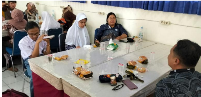
Figure 2. The process of creating a storyline

their accompanying teachers, worked in groups to construct a simple plot with a beginning, middle, and end. The plot development activity was conducted using colored paper, while blind participants worked with their teachers using screen reader tools on their mobile phones. The purpose of this exercise was to help participants understand the basic narrative structure and the relationship among events within a screenplay. This activity also served as a creative learning medium, enabling participants to express ideas concretely and collaboratively.