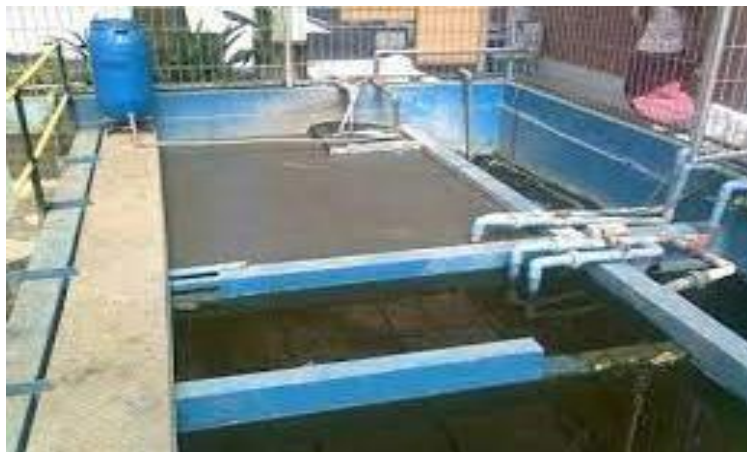
Figure 1. Electroplating Waste Reservoir for UMKM CV. XYZ