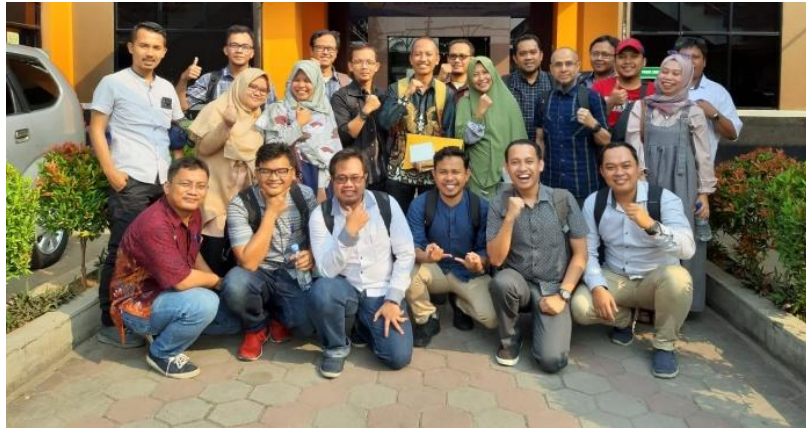
Figure 1. Photo of PKM Lecturers and Management of UMKM CV. XYZ