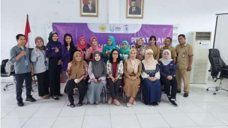
Picture. 5. Group Photo of Healing Journaling Training for UPTD PPA Service Officers in Bogor City