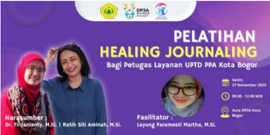
Picture. 4. Healing Journaling Training Banner for UPTD PPA Service Officers Bogor City