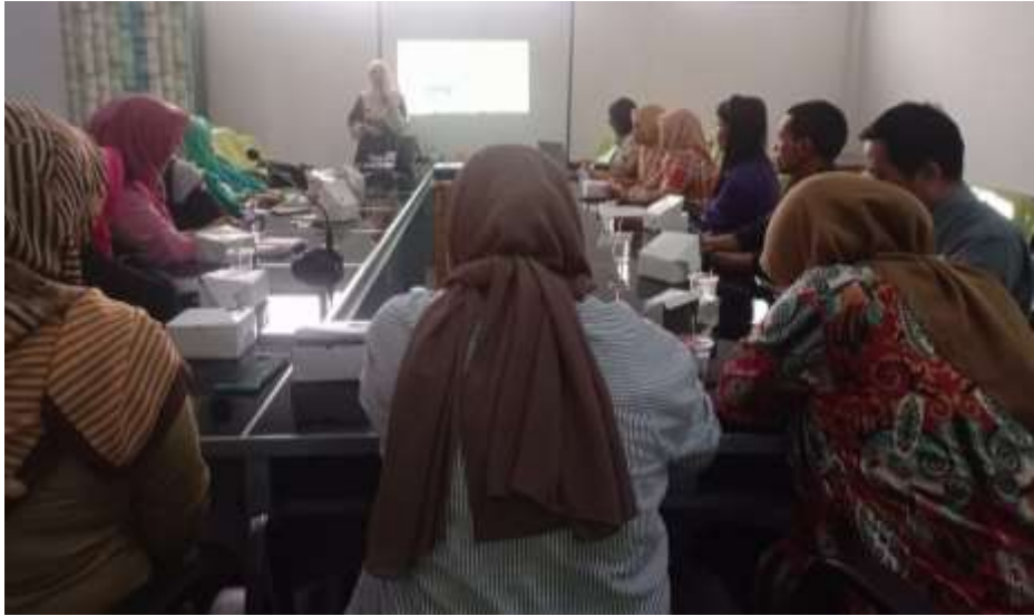
Picture. 6. Session 1 Healing Journaling Training for UPTD PPA Service Officers Bogor City