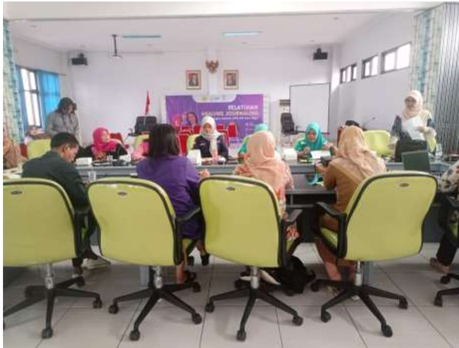
Picture. 6. Session 2 of Healing Journaling Training for UPTD PPA Service Officers in Bogor City