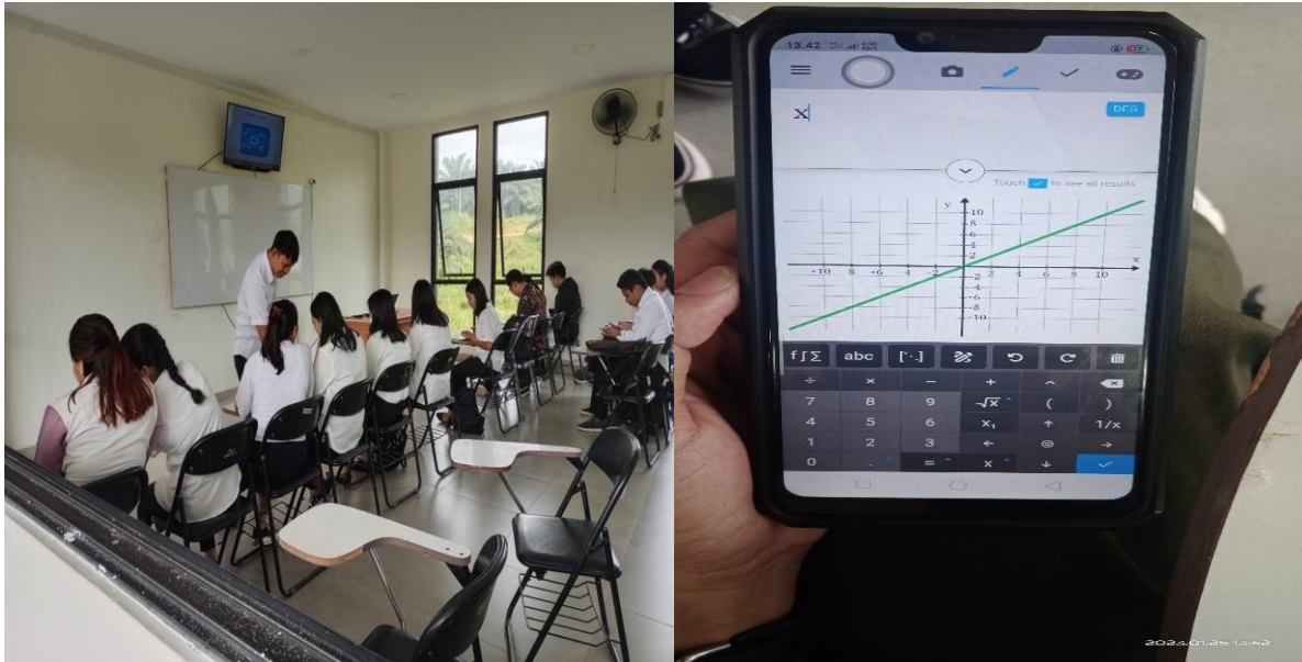
Figure 1. Maple Application Training Implementation Activities