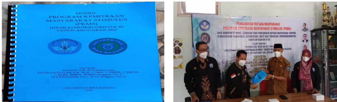
Figure 3 Modules and Submission of Modules to the Pejaten Village Head