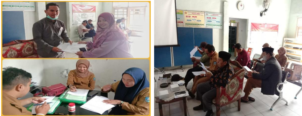
(a) (b) Gambar 8 Pre-Test (a) dan Post-Test (b)

questionnaire (pre-test), namely before training and mentoring was carried out and the second questionnaire (post-test), namely after being given training and mentoring.