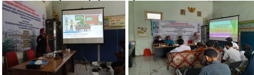
Figure 6 Resource Person for BUMDes Financial Management Materials