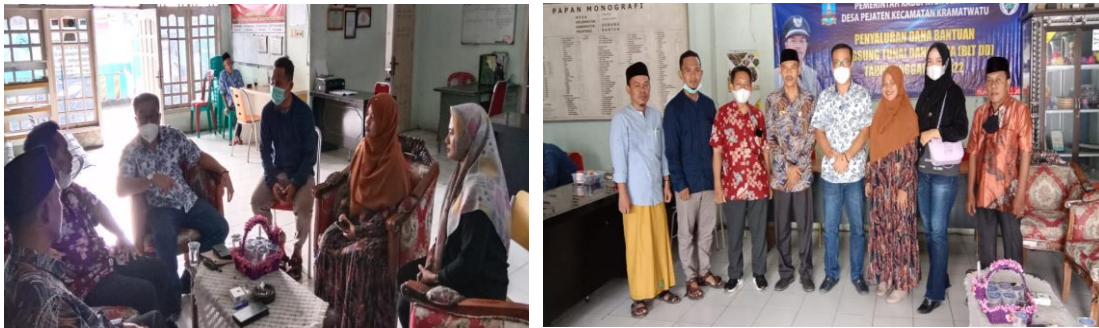
Figure 2 Field Visits And Coordination With Partners

In this step, the following are carried out: Field visits and coordination with Partners; Identification of Partner Problems, including literature study that supports the implementation of this PKMS activity, Focus Group Discussion (FGD) with partners to schedule PKMS implementation; and Conduct socialization of PKMS to Partners.