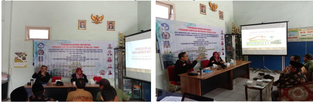
Figure 5 Resource Person for Management Management and the Role of BUMDes