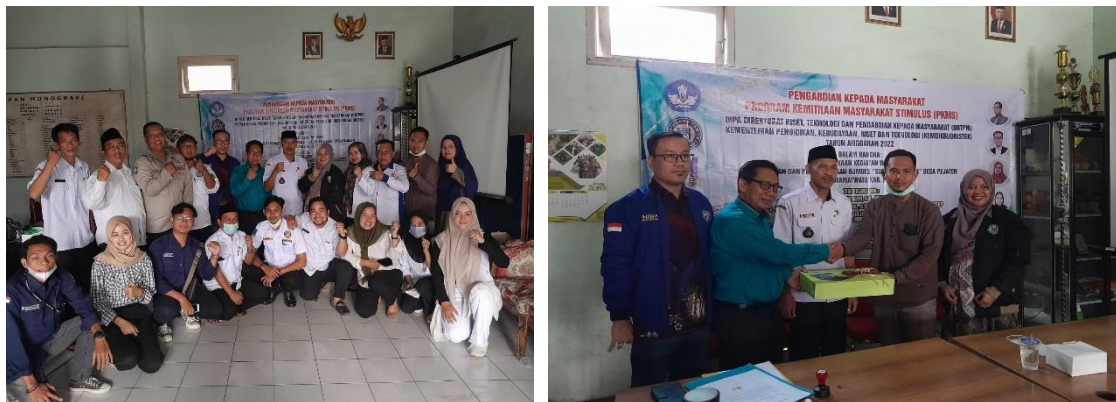
Figure 7 Group Photo and Submission of Goods Grants to Partners