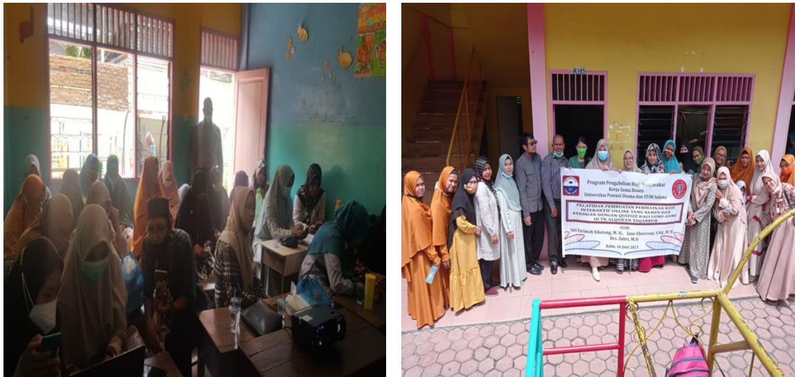
Figure 1. Training Activities with participants (TK Al-Qur'an Taqarrub teachers)

The following results were collected based on the evaluation conducted during the question and answer session, as well as the team's observations during PKM activities: