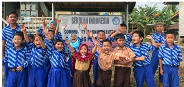
Figure 3. Output of Online Newspaper Publication Result

Usaha ini memproduksi berbagai jenis barang yang terbuat dari tanah liat seperti gerabah, anglo